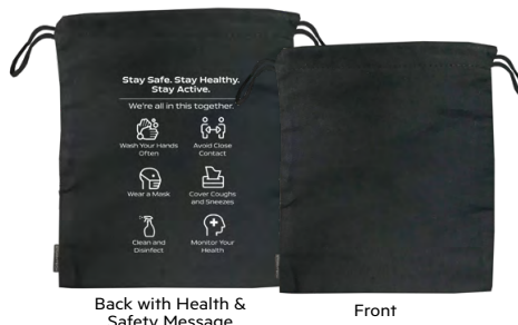
Back with Health & Safety Message

Keep your mask clean and safe with this moisture resistant 100% cotton drawstring storage bag.