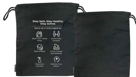
Back with Health & Safety Message

Keep your mask clean and safe with this moisture resistant 100% cotton drawstring storage bag.