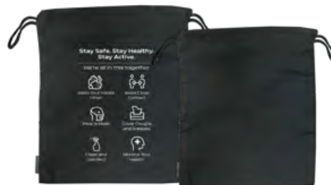
Back with Health & Safety Message

Keep your mask clean and safe with this moisture resistant 100% cotton drawstring storage bag.