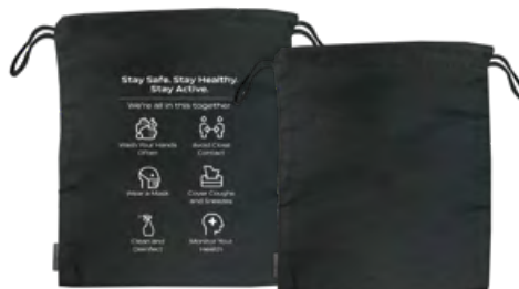
Back with Health & Safety Message

Keep your mask clean and safe with this moisture resistant 100% cotton drawstring storage bag.