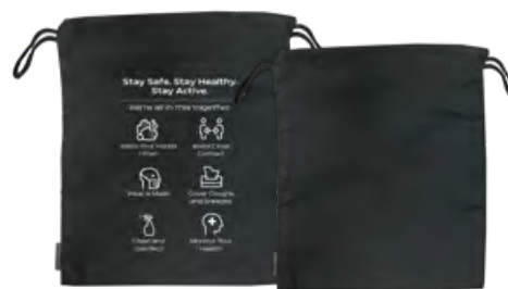
Back with Health & Safety Message

Keep your mask clean and safe with this moisture resistant 100% cotton drawstring storage bag.