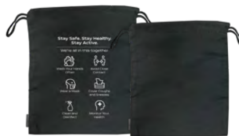
Back with Health & Safety Message

Keep your mask clean and safe with this moisture resistant 100% cotton drawstring storage bag.