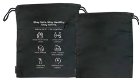
Back with Health & Safety Message

Keep your mask clean and safe with this moisture resistant 100% cotton drawstring storage bag.